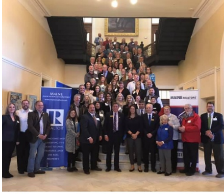
Pictured: 2019 Rally Day

8:01am- Check your email for an ACTION message , click and respond to the CALL for ACTION, you can do this from ANYWHERE . Your response will be delivered directly to your State Senator and House Representative. (Don't worry, you just need to follow 2 prompts!)