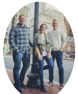
The Boom Team

*To be eligible for Gift Card Give-A-Way, must attend October 6 from 10-11 a.m.; October 7 from 10-11 a.m. and 12:45-2:00 p.m. and October 8 beginning at 12:30 p.m.